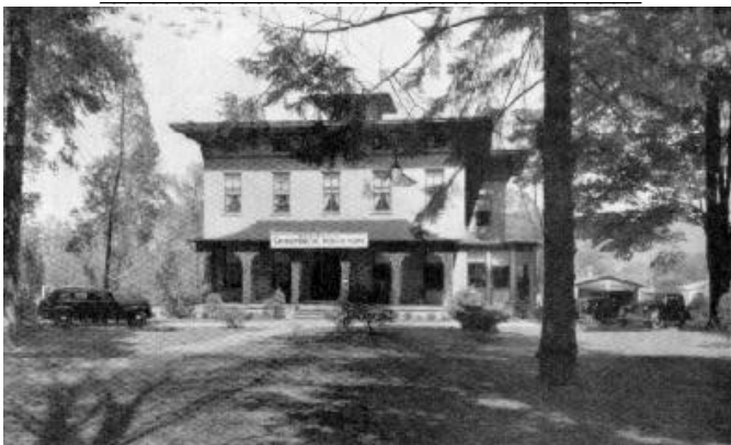
Chiropractic Health Home, Athens, Pennsylvania (What, 1938)