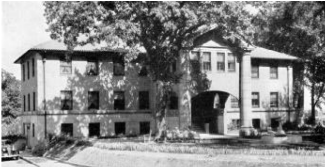
Forest Park Chiropractic Sanitarium, Davenport, Iowa (What, 1938)