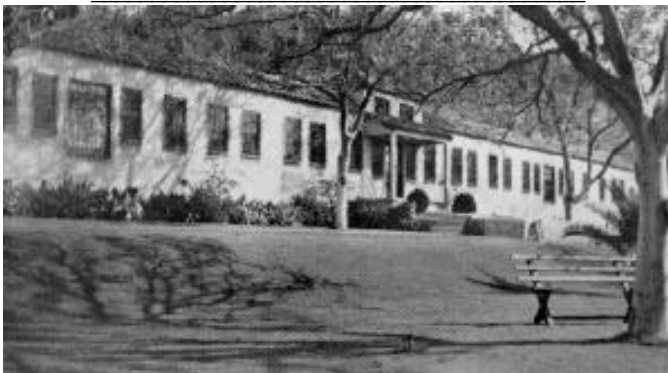
Main Building of Grand View Sanitarium, Whittier, California (What, 1938)