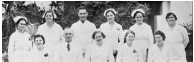
"Chief of Staff and Nurses Who Minister to Your Every Want," Beeman's Sanitarium, Whittier, California (What, 1938)