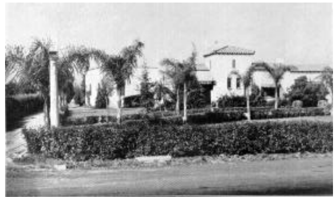
Dr. C. Beeman's Sanitarium, Whittier, California (What, 1938)