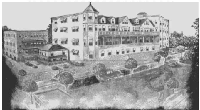
Excelsior Chiropractic Sanitarium, Excelsior Springs, Missouri (What, 1938)