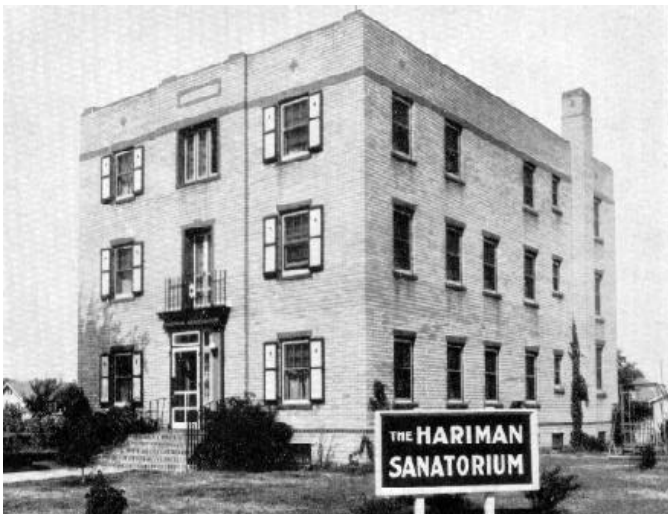
Hariman Sanatorium, Inc., Grand Forks, North Dakota