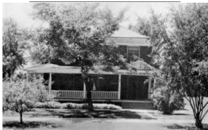
Idaho Health Hospital & Clinic, Idaho Falls, Idaho (What, 1938)