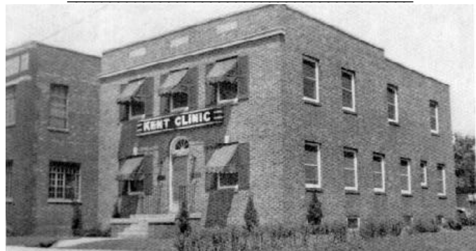
Kent Clinic & Sanitarium, Galesburg, Illinois (What, 1938)