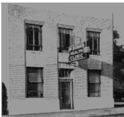
McDonald Health Clinic & Drugless Sanatorium, Inc., ?Address? (What, 1938)