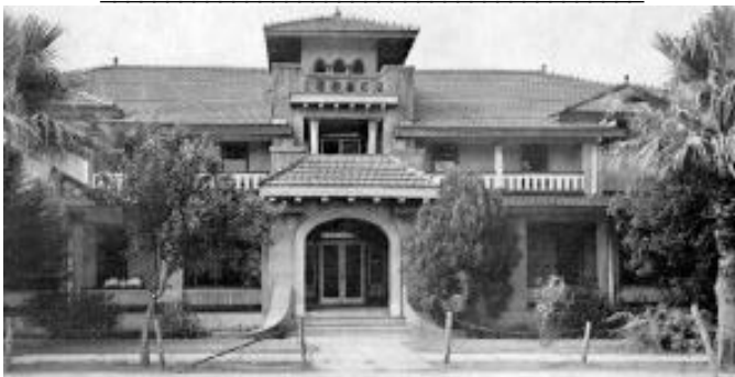
Bon-Aire Sanatorium of San Antonio, Texas (What, 1938)