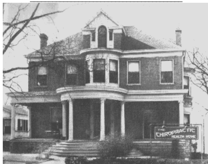
Chiropractic Health Home, "A Scientific Chiropractic Health Institution," 501 College St., at Washington Ave., Macon, Georgia (What, 1938)