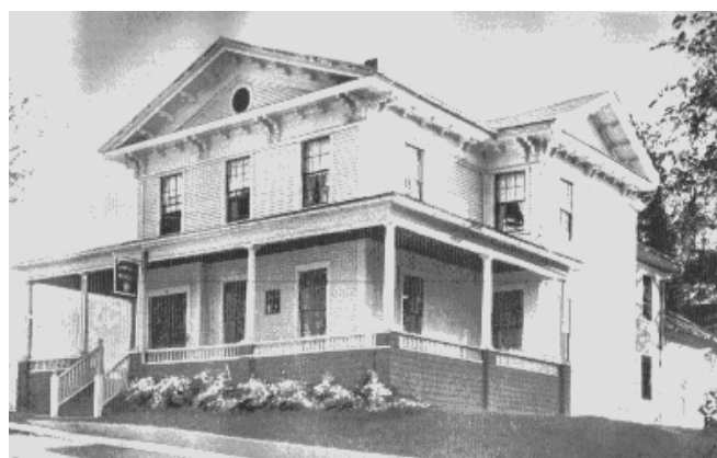
The Community Hospital, 50 West Street, Rutland, Vermont (What, 1938)