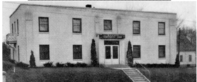
Bakkum Chiropractic Clinic & Hospital, Waukon, Iowa (What, 1938)