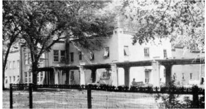
Trotter Park Hotel Sanitarium, 3137 Main Street, Kansas City, Missouri (What, 1938)