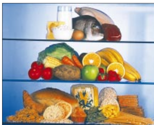
In the Hay diet proteins and starch must be eaten separately, though fruit and vegetables can be eaten with either