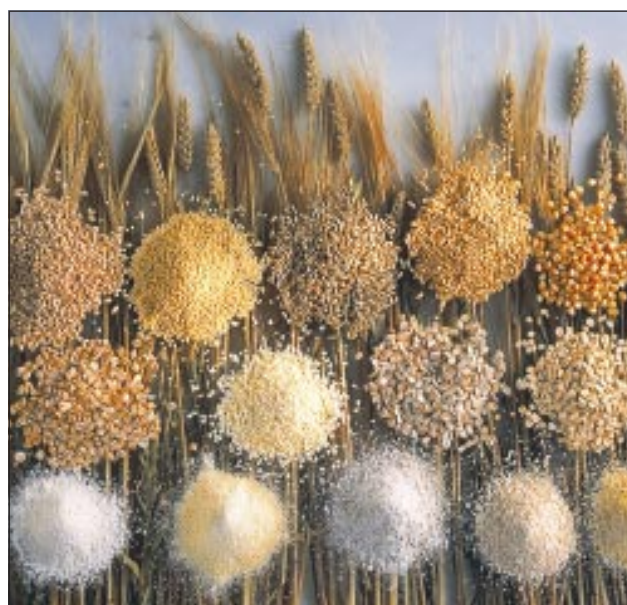
In the Stone Age diet grains, pulses, and other products of the agricultural revolution must be avoided. Such exclusion diets can be highly restrictive, socially disruptive, and expensive