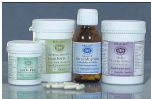
Some typical nutritional supplements. Though often perceived by the public to be inherently safe, supplements can sometimes be associated with adverse effects, especially when taken in high doses for long periods