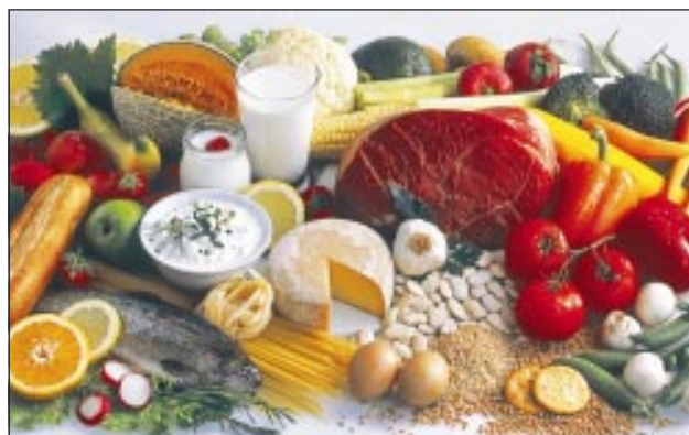
Conventional doctors only rarely make use of nutritional interventions, which is perhaps one reason why nutritional medicine has come to be regarded as part of complementary medicine

This involves more comprehensive changes in eating patterns. Many diets, such as vegetarianism and veganism, originated as “movements” characterised by political and ecological concerns, a moral stance towards food, and a view of diet as inseparable from lifestyle. Many diets are based on theoretical considerations rather than empirical data. For example, the