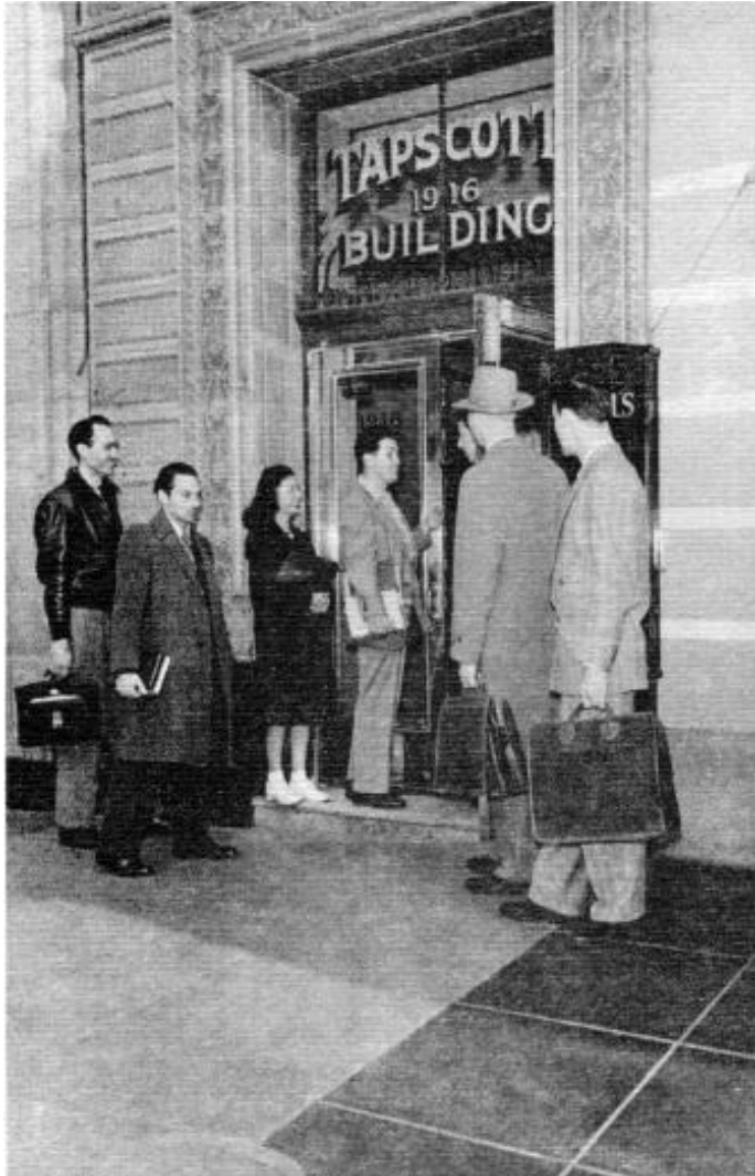
Entrance to CCC/Oakland at 1916 Tapscott Bldg, Oakland -from “History of Our College”:

The California Chiropractic College, founded July 13, 1913, is incorporated and chartered under the laws of the State of California, and by its articles of incorporation is empowered “to teach Chiropractic and all subjects incident to a knowledge of the