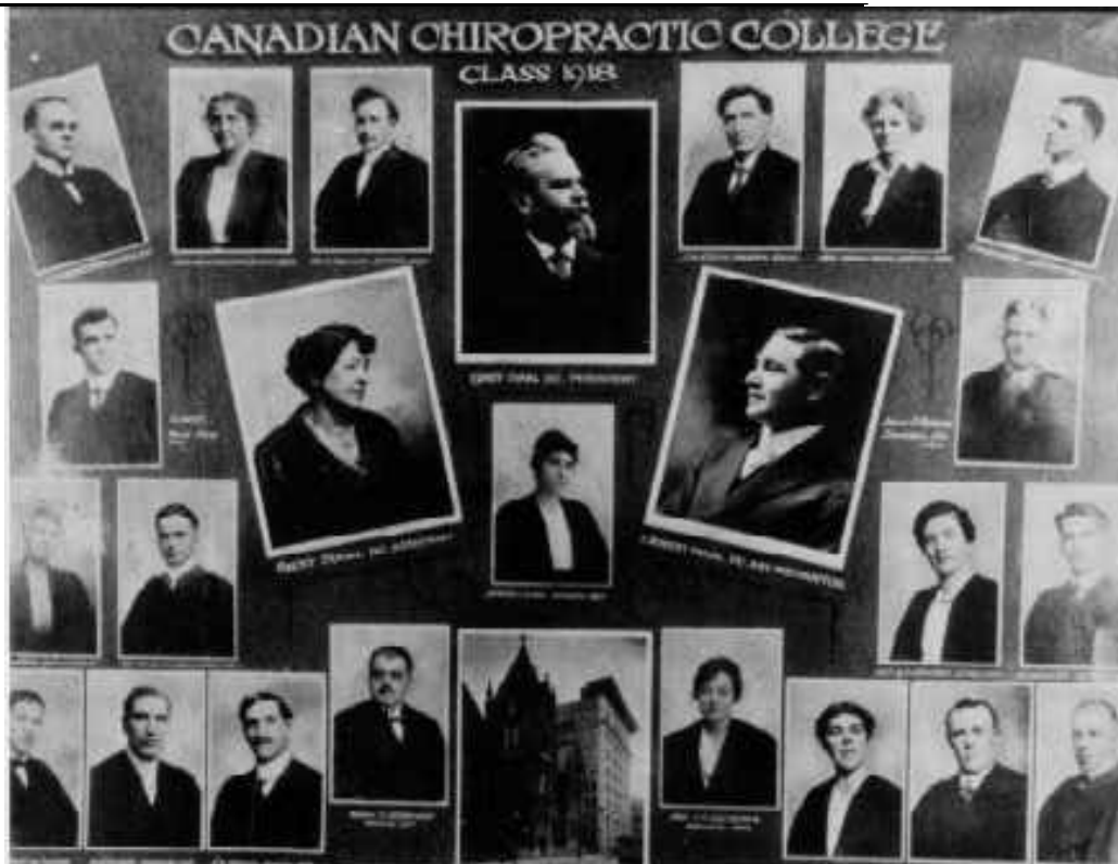
Figure ??: Graduating class of the Canadian Chiropractic College, 1918