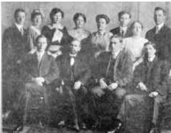
Figure ??: "Opening Class of the C.C.C." from brochure of the Canadian Chiropractic College,

back to Canada to establish the college, which opened its doors in 1914 (see Figures ?? & ?? ). It should be noted that World War 1 began in 1914 and must have had a negative effect on enrollment until 1919 when demobilization was complete. ( Biggs, 1989, p. 216 ; Keating, 1994 ; Rehm, 1980, p. 285 ) The chiropractic philosophy was straight and patterned after the PSC ap-