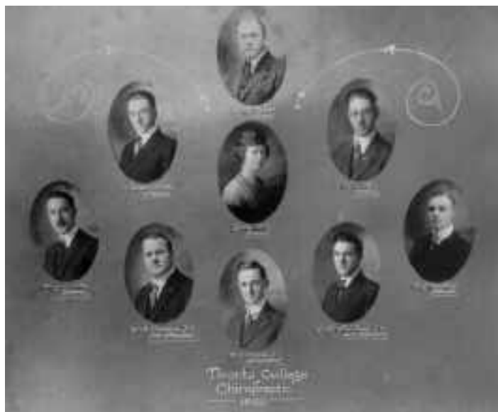
Figure ??: Graduation photo, TCC, 1920

Although the TCC grew rapidly and soon graduated more graduates than the CCC, very little is known of its academic program including clinical education. The TCC was founded in 1920 by CCC graduates John S. Clubine and J.A. Cudmore, both of Toronto. The 1920 graduation class photograph (see Figure ?? ) identifies only six graduates, whereas the 1921