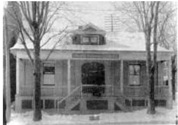
Figure ??: "Home of the C.C.C." at 267 King Street West, Hamilton, Ontario; from brochure of the Canadian Chiropractic College, 1914