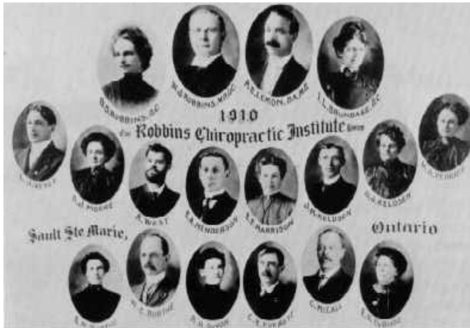
Figure 1: First graduating class of the Robbins Chiropractic Institute, 1910