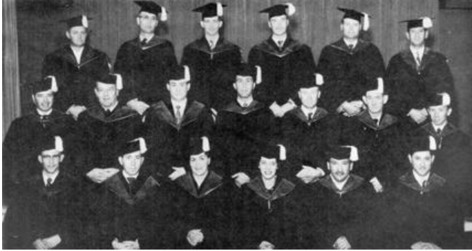
HOLLYWOOD COLLEGE OF CHIROPRACTIC GRADUATING CLASS, JUNE 1954