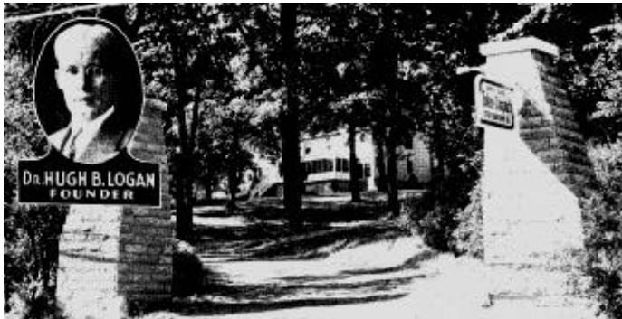
Logan Basic College of Chiropractic, 7701 Florissant Road, St. Louis, Missouri, circa 1938