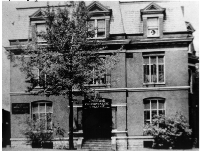
Campus of the Missouri Chiropractic College, undated

1934 (Spring): Missouri Chiropractic College purchases 3-story masion at 3117 Lafayette Avenue (Reinert, 1992); undated photograph: