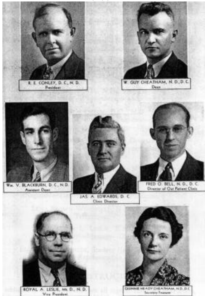
Officers & Faculty of the Nashville College of Chiropractic at 1803 West End Avenue, Nashville; catalogue indicates that "other division sof the college are located elsewhere