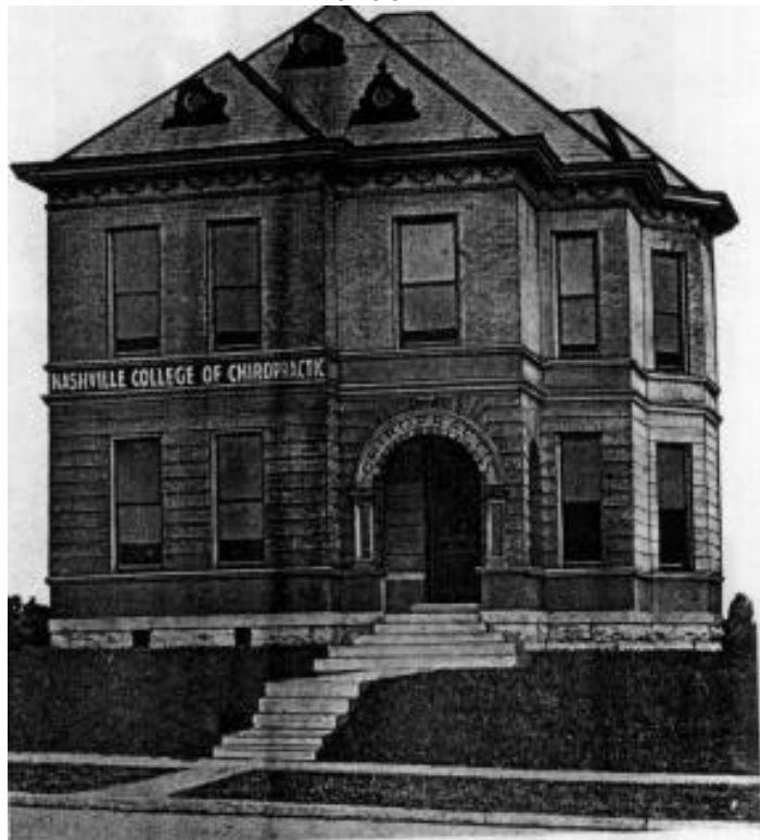
Campus of the Nashville College of Chiropractic at 1803 West End Avenue, Nashville; catalogue indicates that "other division sof the college are located elsewhere (WSCC Archives)

c1935: catalogue of the Nashville College of Drugless Therapy, Inc. lists address as 1803 West End Avenue, Nashville TN; "Officers & Faculty" include: