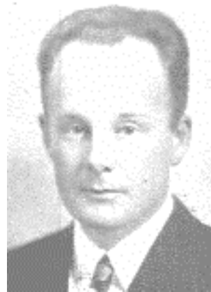
D.O. Pharaoh, D.C. Anatomy