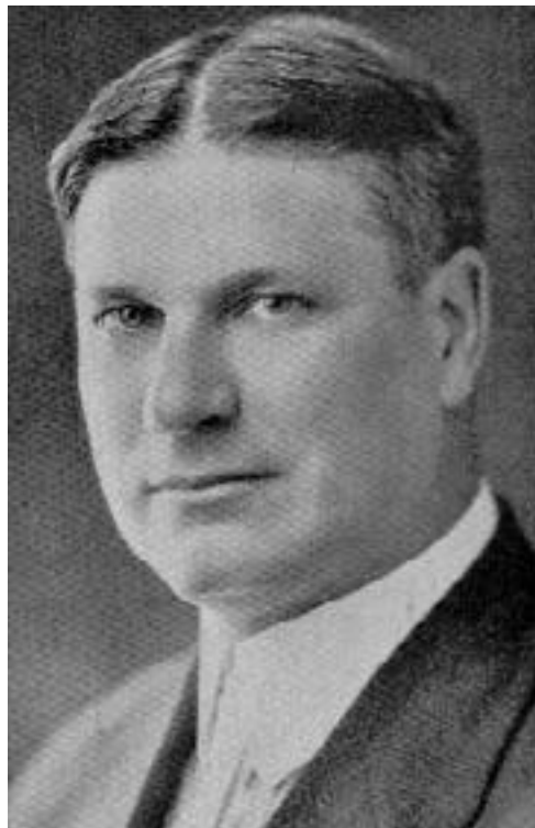
-following photos from a Palmer School of Chiropractic catalog, undated, circa 1949