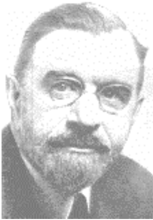
B.J. Palmer, D.C., Ph.C. Philosophy