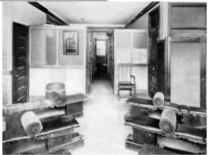
"Clinic Dressing Rooms," from the Ratledge School's 1923 Annual Announcement