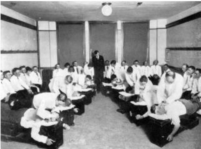
"Class Room Clinic," from the Ratledge School's 1923 Annual Announcement