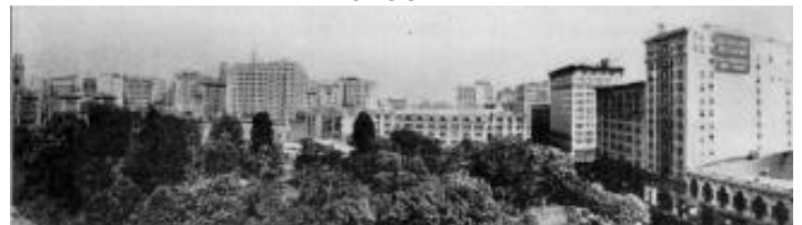
"Central Park and Business Sky-Line of Los Angeles," from the Ratledge School's 1923 Annual Announcement