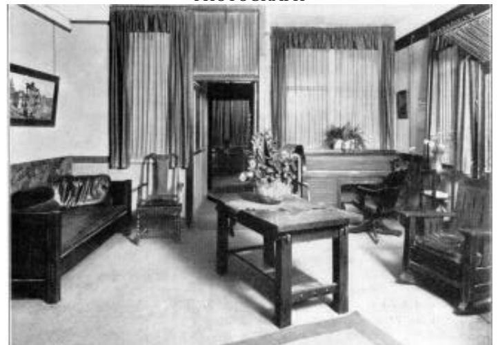
RSCS "General Reception Room," from the Ratlidge School's 1923 Annual Announcement