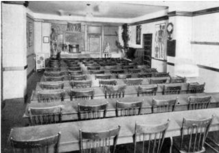
"Main Lecture Hall," from the Ratledge School's 1923 Annual Announcement