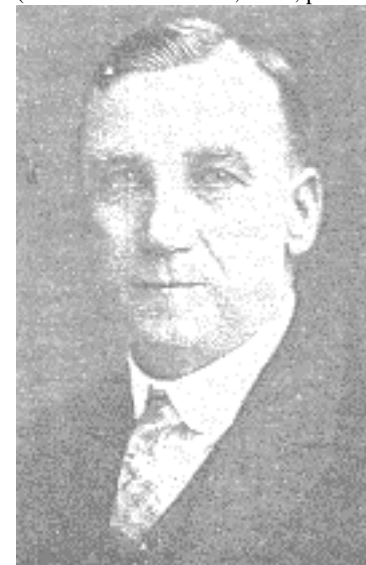
(from the Bulletin of the ACA 1929 [Apr]; 6[2]: 2)