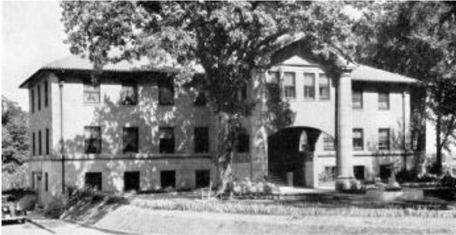
Forest Park Chiropractic Sanitarium, Davenport, Iowa (What, 1938)