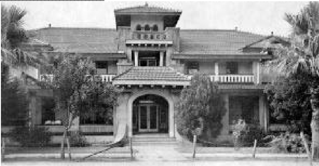
Bon-Aire Sanatorium of San Antonio, Texas (What, 1938)