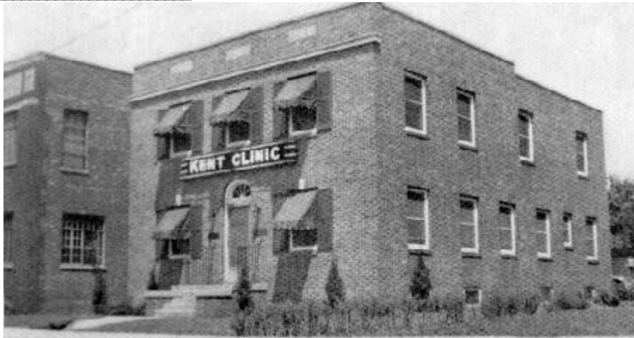
Kent Clinic & Sanitarium, Galesburg, Illinois (What, 1938)