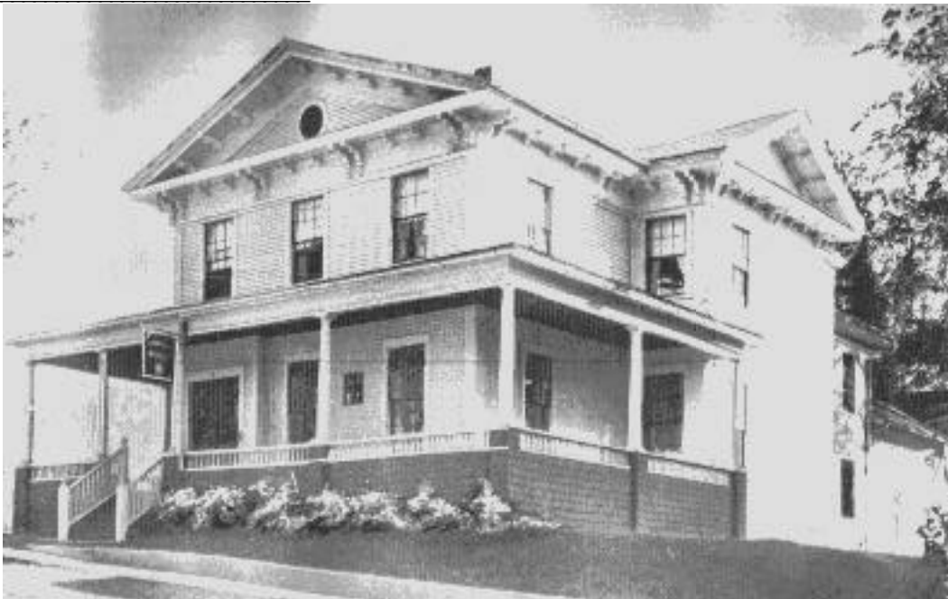
The Community Hospital, 50 West Street, Rutland, Vermont (What, 1938)