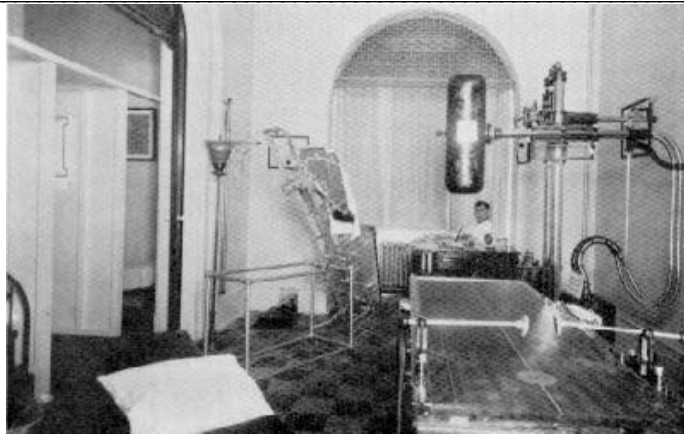
"A Modern Adjusting Room" at the Brennan Chiropractic Health Home, ?New York State? (What, 1938)