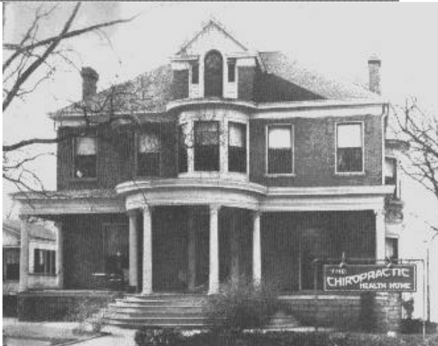
Chiropractic Health Home, "A Scientific Chiropractic Health Institution," 501 College St., at Washington Ave., Macon, Georgia (What, 1938)