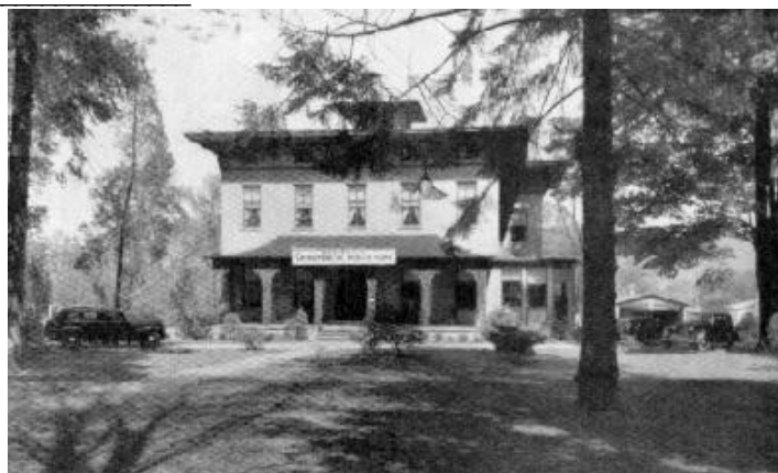
Chiropractic Health Home, Athens, Pennsylvania (What, 1938)