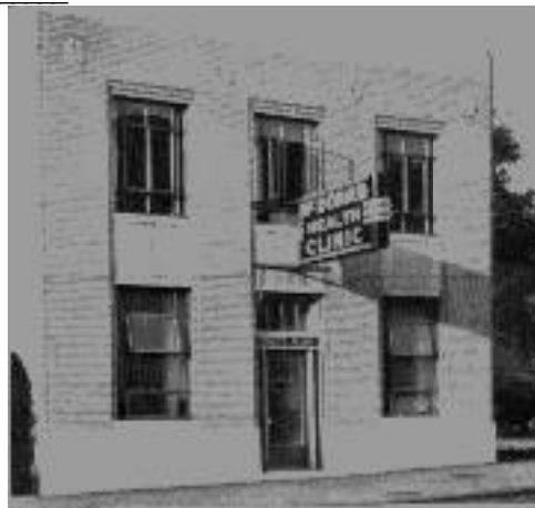
McDonald Health Clinic & Drugless Sanatorium, Inc., ?Address? (What, 1938)