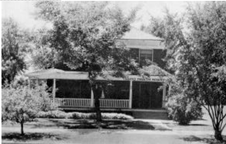
Idaho Health Hospital & Clinic, Idaho Falls, Idaho (What, 1938)