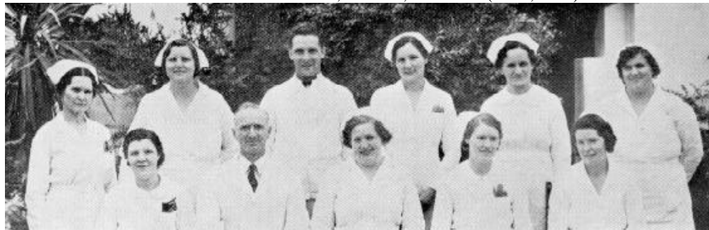
"Chief of Staff and Nurses Who Minister to Your Every Want," Beeman's Sanitarium, Whittier, California