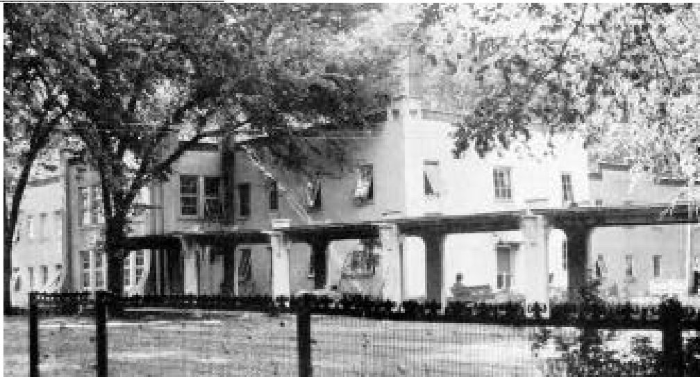
Trotter Park Hotel Sanitarium, 3137 Main Street, Kansas City, Missouri (What, 1938)