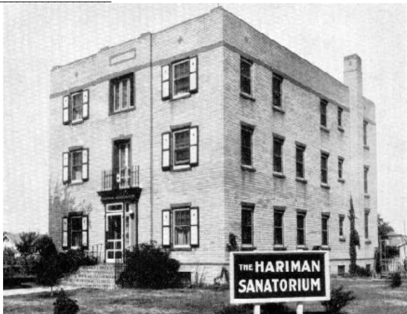
Hariman Sanatorium, Inc., Grand Forks, North Dakota (What, 1938)