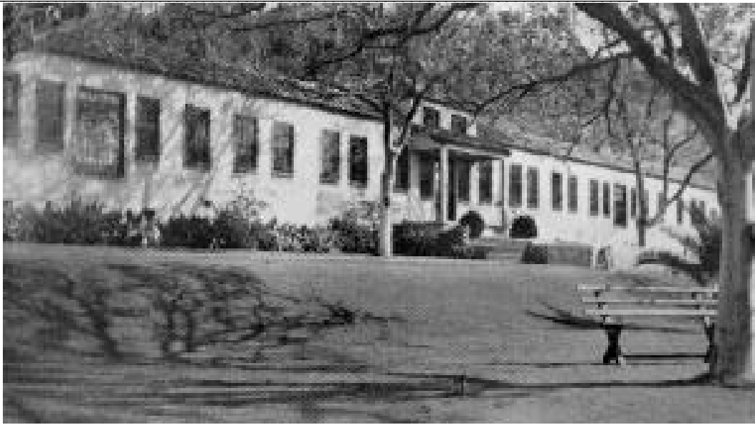
Main Building of Grand View Sanitarium, Whittier, California (What, 1938)