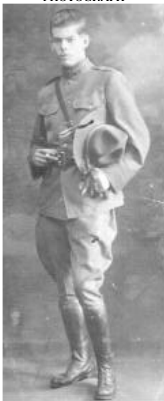
Figure ??: Thurman G. Fleet, circa 1916