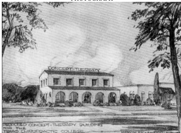
Figure: artist's rendering of proposed "Concept-Therapy Building for the Texas Chiropractic College" (circa 1948?)