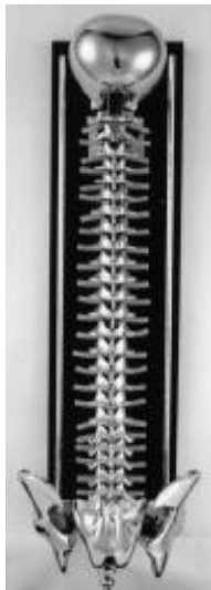
Fleet's Spinal Demonstrator