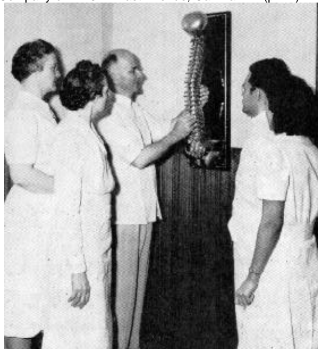
Figure ??: Fleet's Spinal Demonstrator, as depicted in the National Chiropractic Journal (Advertisement, 1940)

1940 (Dec): National Chiropractic Journal [9(12)] includes: -ad for Fleet's Spinal Demonstrator from Doctors Products Company of 1243 N. East Avenue, Oak Park IL (p. 41):