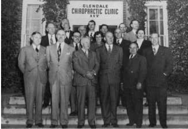
"Members of the National Council on Education pause for the photographer as they are greeted at the Belmont entrance of the Los Angeles College of Chiropractic Clinic by College officials"

-photograph of Council members in Glendale (p. 20):