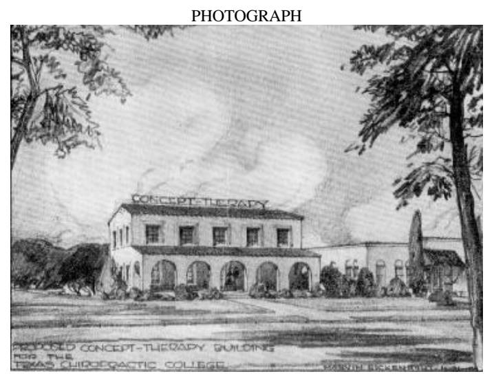
Figure: artist's rendering of proposed "Concept-Therapy Building for the Texas Chiropractic College" (circa 1948?)