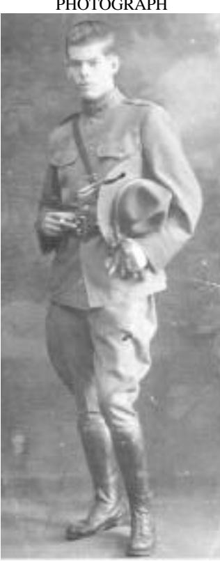
Figure ??: Thurman G. Fleet, circa 1916 PHOTOGRAPH