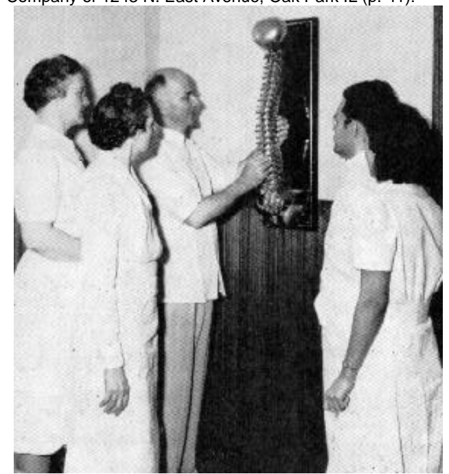
Figure ??: Fleet's Spinal Demonstrator, as depicted in the National Chiropractic Journal (Advertisement, 1940)

1940 (Dec): National Chiropractic Journal [9(12)] includes: -ad for Fleet's Spinal Demonstrator from Doctors Products Company of 1243 N. East Avenue, Oak Park IL (p. 41):