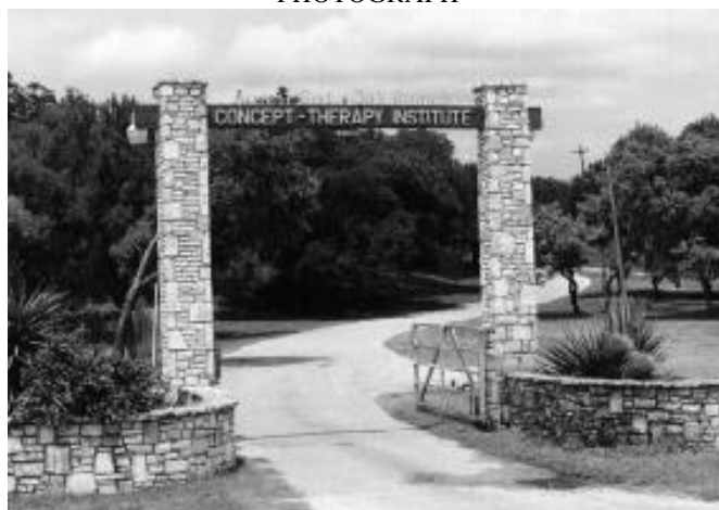
Entrance to Concept-Therapy Institute's International Headquarters north of San Antonio, Texas