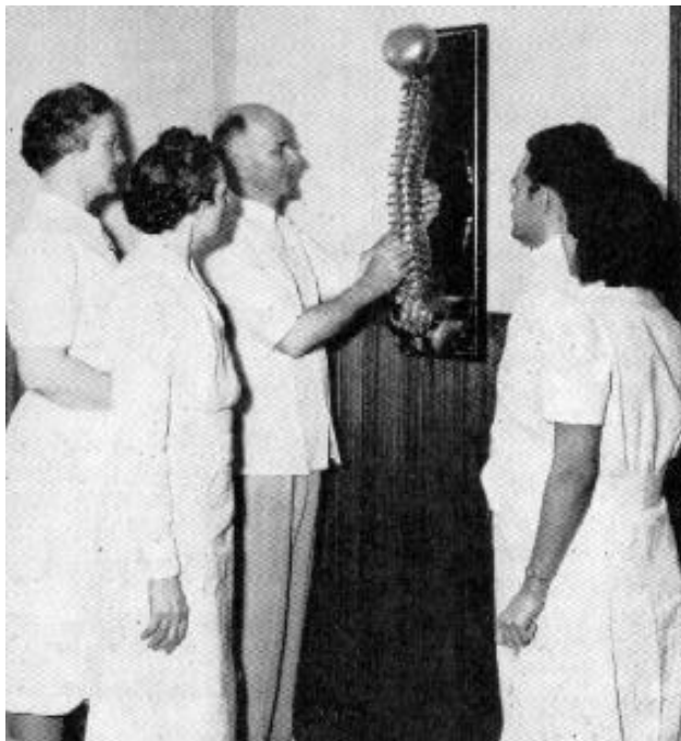
Fleet's Spinal Demonstrator, as depicted in the National Chiropractic Journal ( Advertisement, 1940 )

1940 (Dec): National Chiropractic Journal [9(12)] includes: -ad for Fleet's Spinal Demonstrator from Doctors Products Company of 1243 N. East Avenue, Oak Park IL (p. 41):