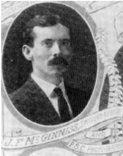
from Peters & Chance, 1993