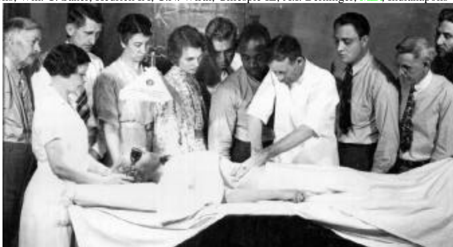
Cover of Chiropractic History 1991 (June); 11(1)