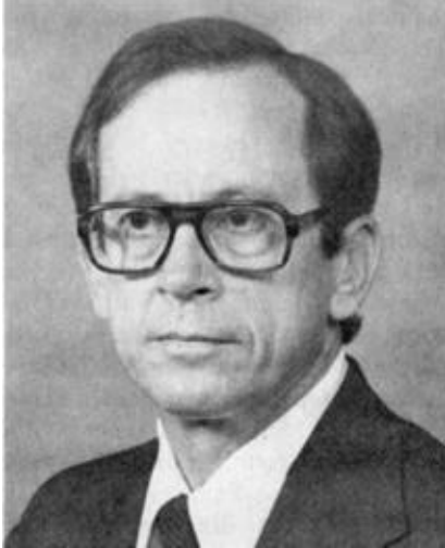
ABOUT THE AUTHOR