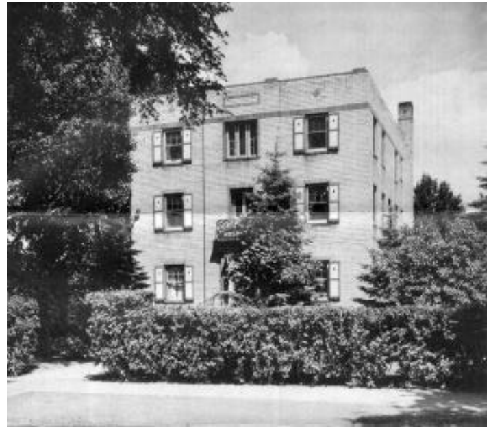
Hariman Hospital (from undated brochure)