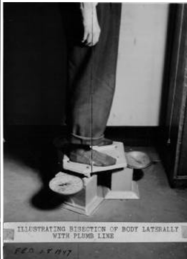
National Chiropractic Journal 1947 (May); 17(5): 16