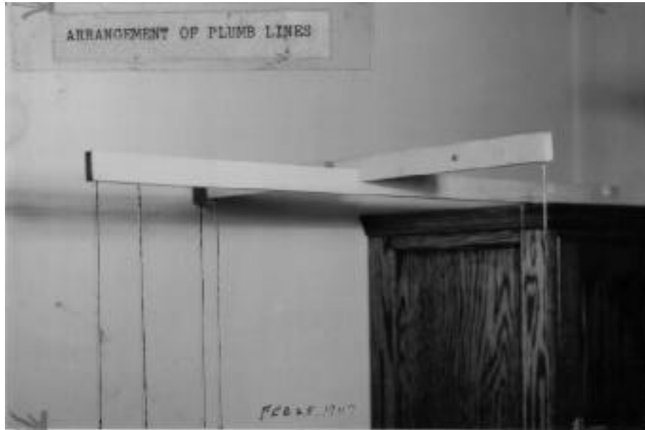
National Chiropractic Journal 1947 (May); 17(5): 16; from article by Weiant, Burry & Ulrich