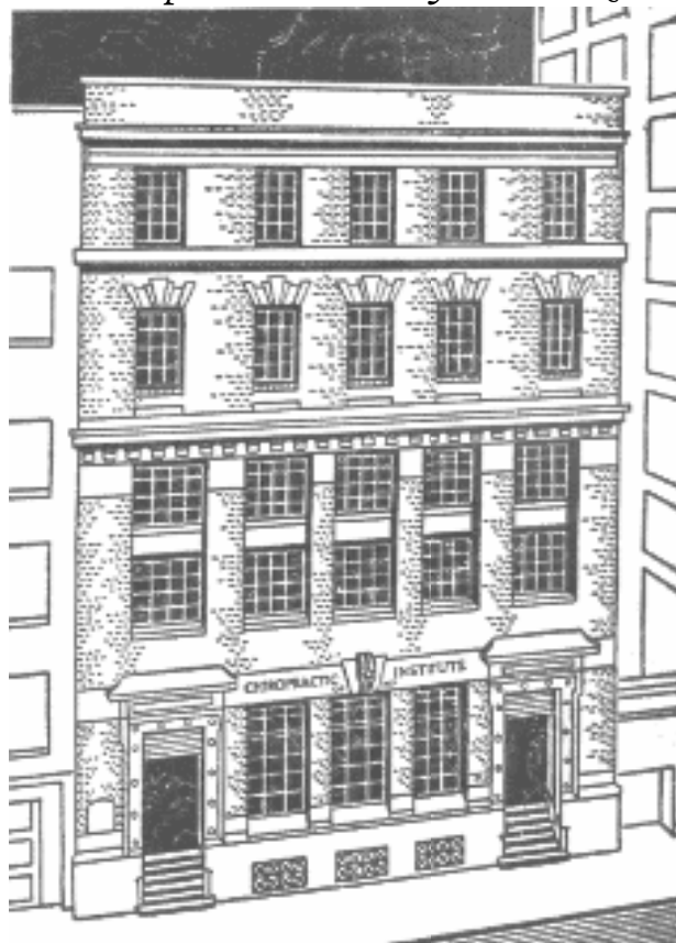
CHIROPRACTIC INSTITUTE OF NEW YORK