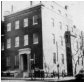
Campus of the Columbia College of Chiropractic in Baltimore (Miscellany, 1985)