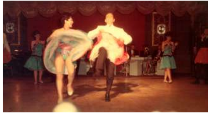
1967 (June): photograph: ACA Board of Governors does the "can-can" during meeting in St. Louis: