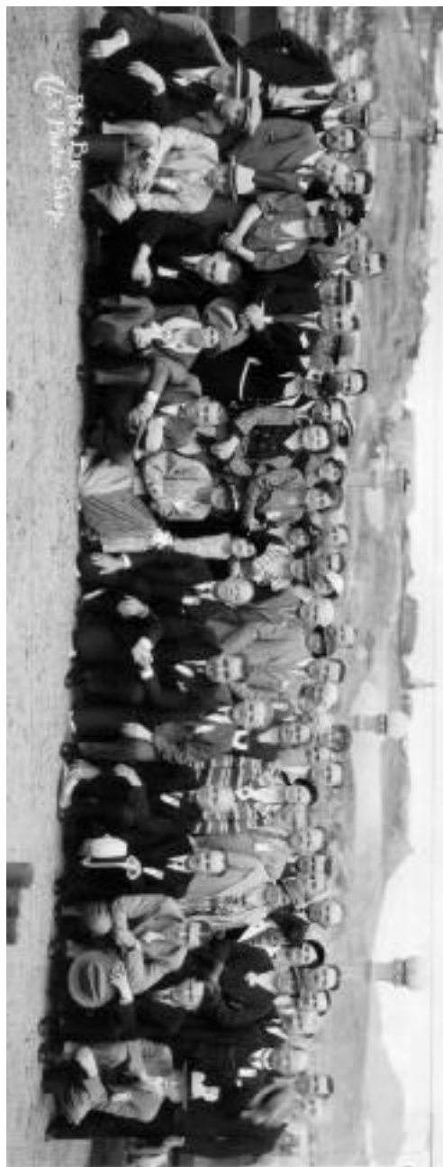
Montana Chiropractic Association convention at Butte, Montana during September 10-12, 1934; from The Chiropractic Journal (NCA) 1934 (Nov); 3(11): 23