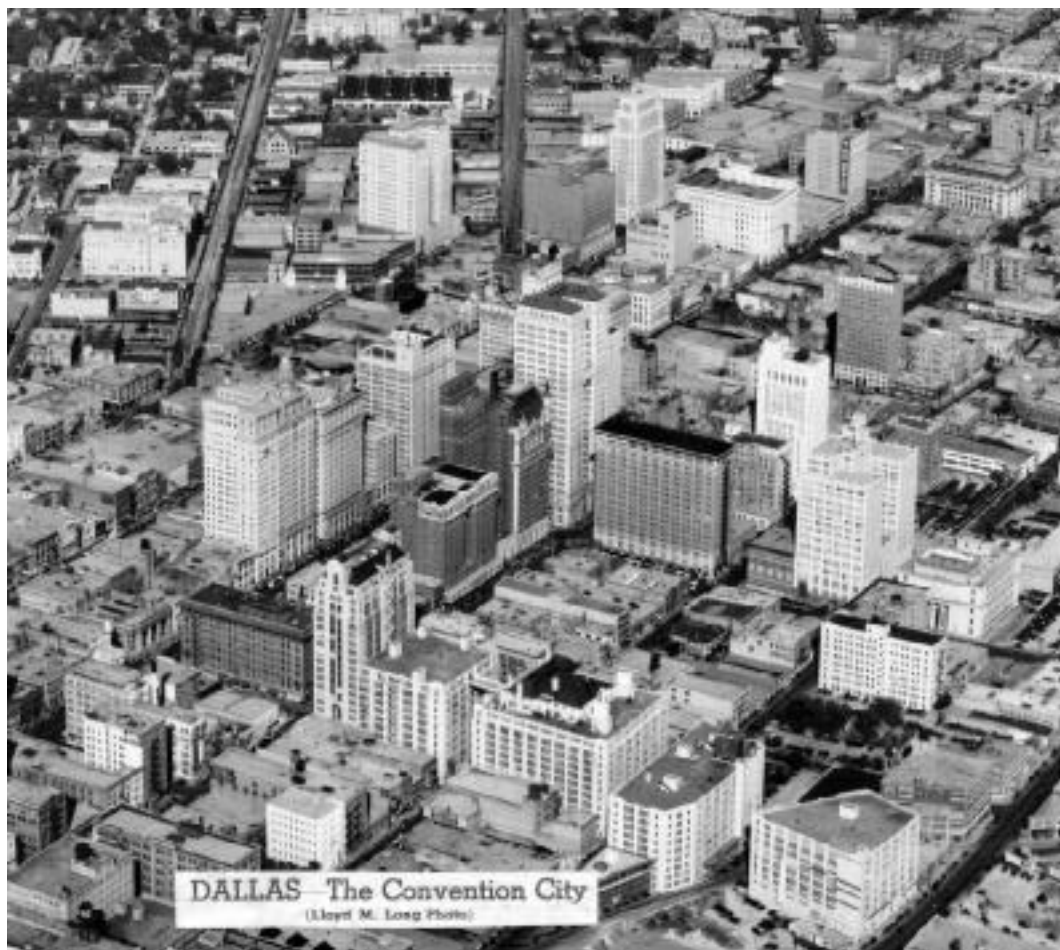
National Chiropractic Journal 1939 (May); 8(5): cover. Published for 1939 Convention; photo taken 12/22/31; Central Business District of Dallas