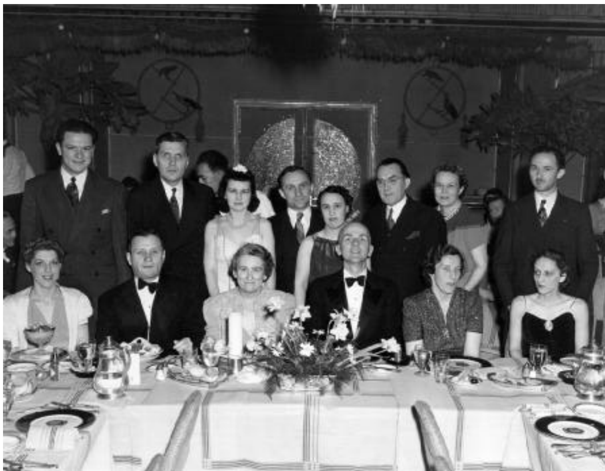
Unknown banquet group at Adolphus Hotel, Dallas