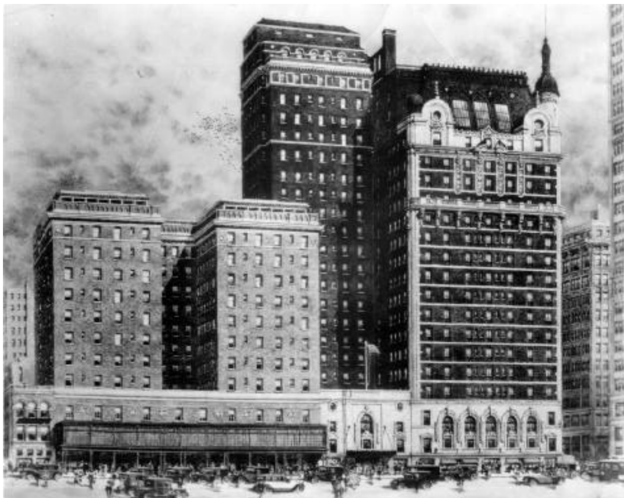
National Chiropractic Journal 1939 (Apr); 8(4): 4; caption reads: "Official Convention Headquarters; Plan Now for the National Chiropractic Convention, Dallas, Texas, Adolphus Hotel, July 23-28, Inc."