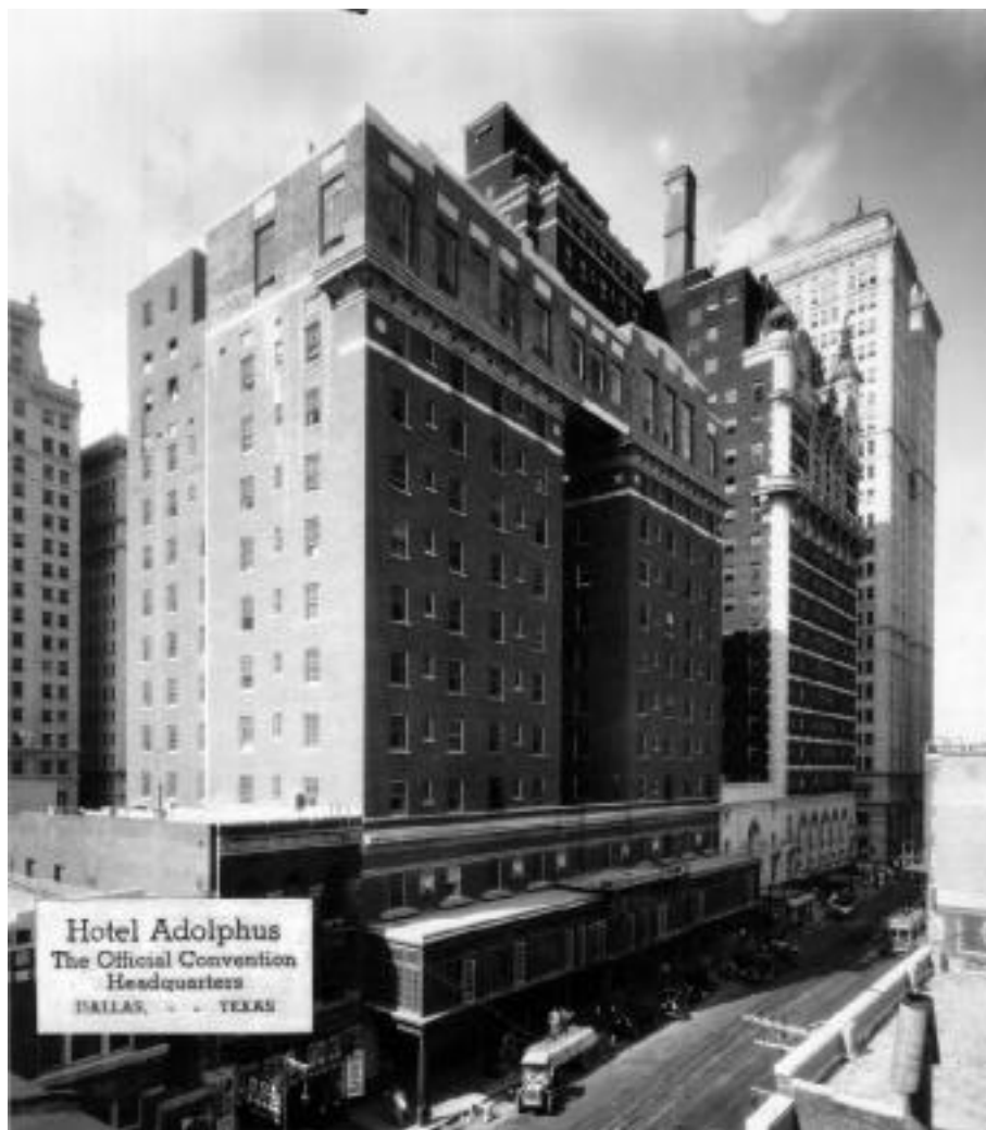
National Chiropractic Journal 1939 (July); 8(7): cover