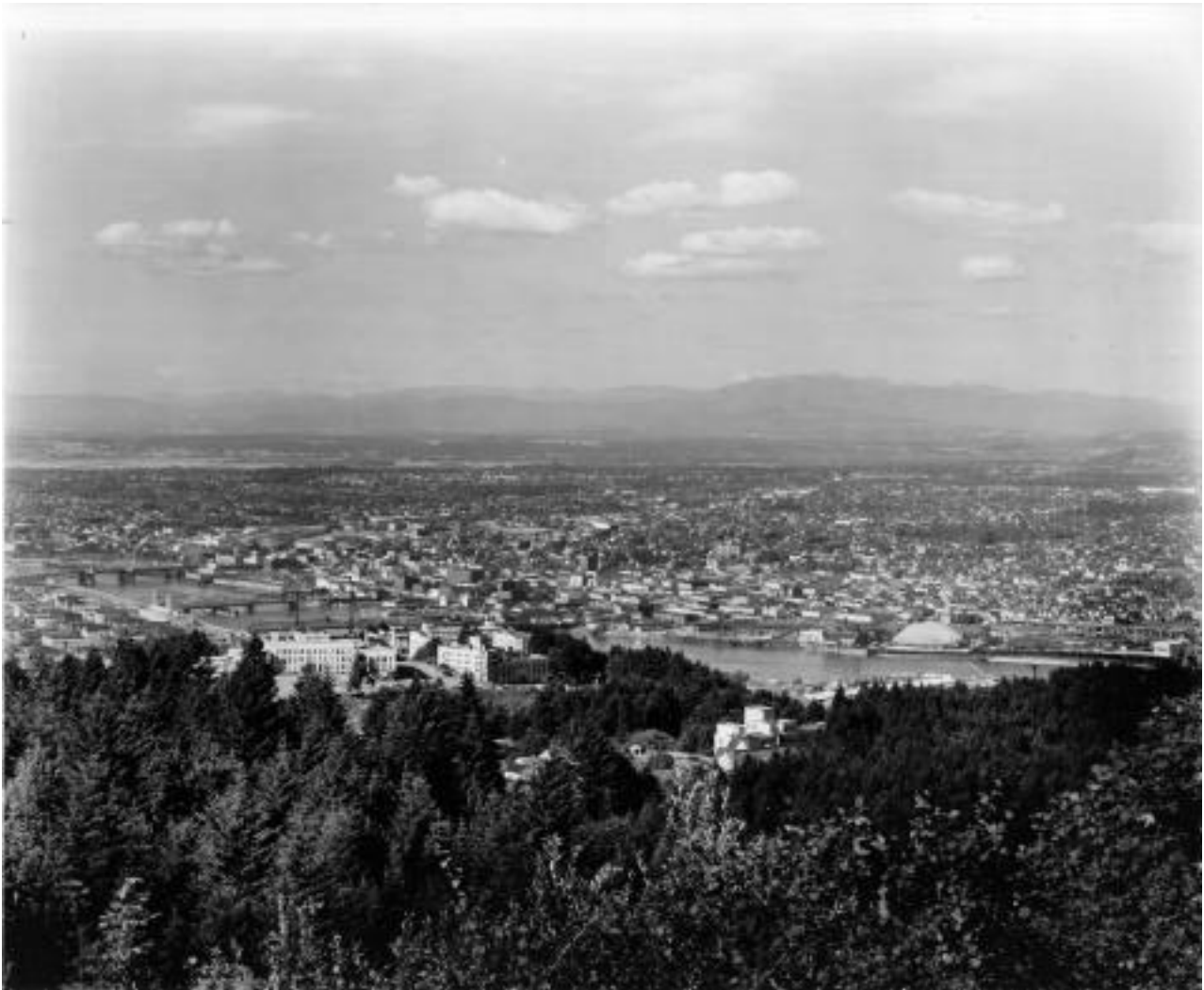
National Chiropractic Journal 1948 (Mar); 18(3): 9; journal caption reads: "Portland, the City of Roses, is a friendly, rambling, progressive city of homes and gardens. It is the hub and nerve center of Oregon and the vast Columbia empire which is rapidly becoming an important industrial city of the great Northwest." Caption on back of photo reads: "Portland, Ore. from Council Crest Hill. Willamette River in foreground. Mt. Hood (showing in white) on horizon"