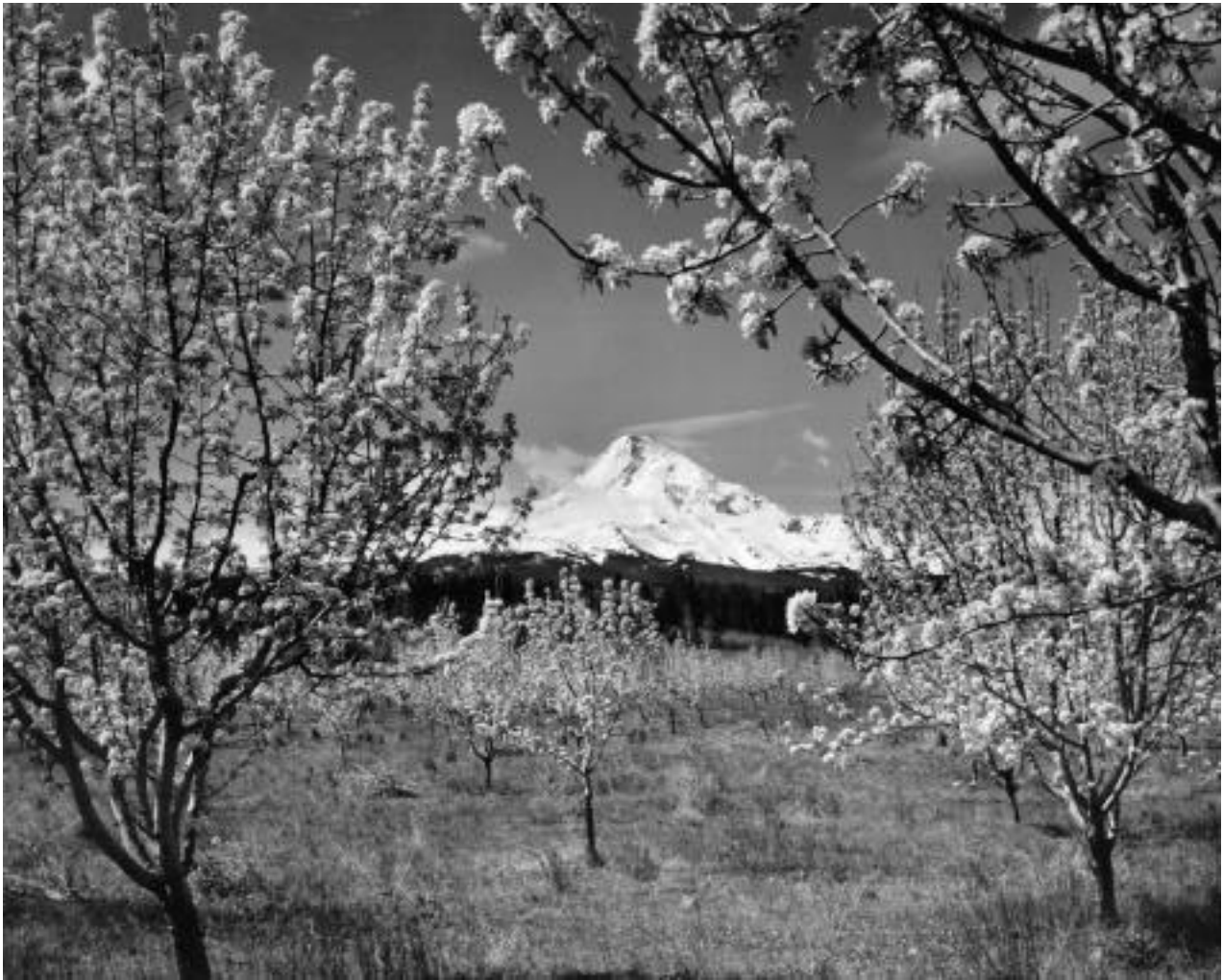
National Chiropractic Journal 1948 (Feb); 18(2): 21; journal caption reads: "Beatiful Mt. Hood - A Crowning Glory of Oregon." Caption on back of photo reads: "Mt. Hood, 11,245 feet high and Hood River Valley in Oregon"