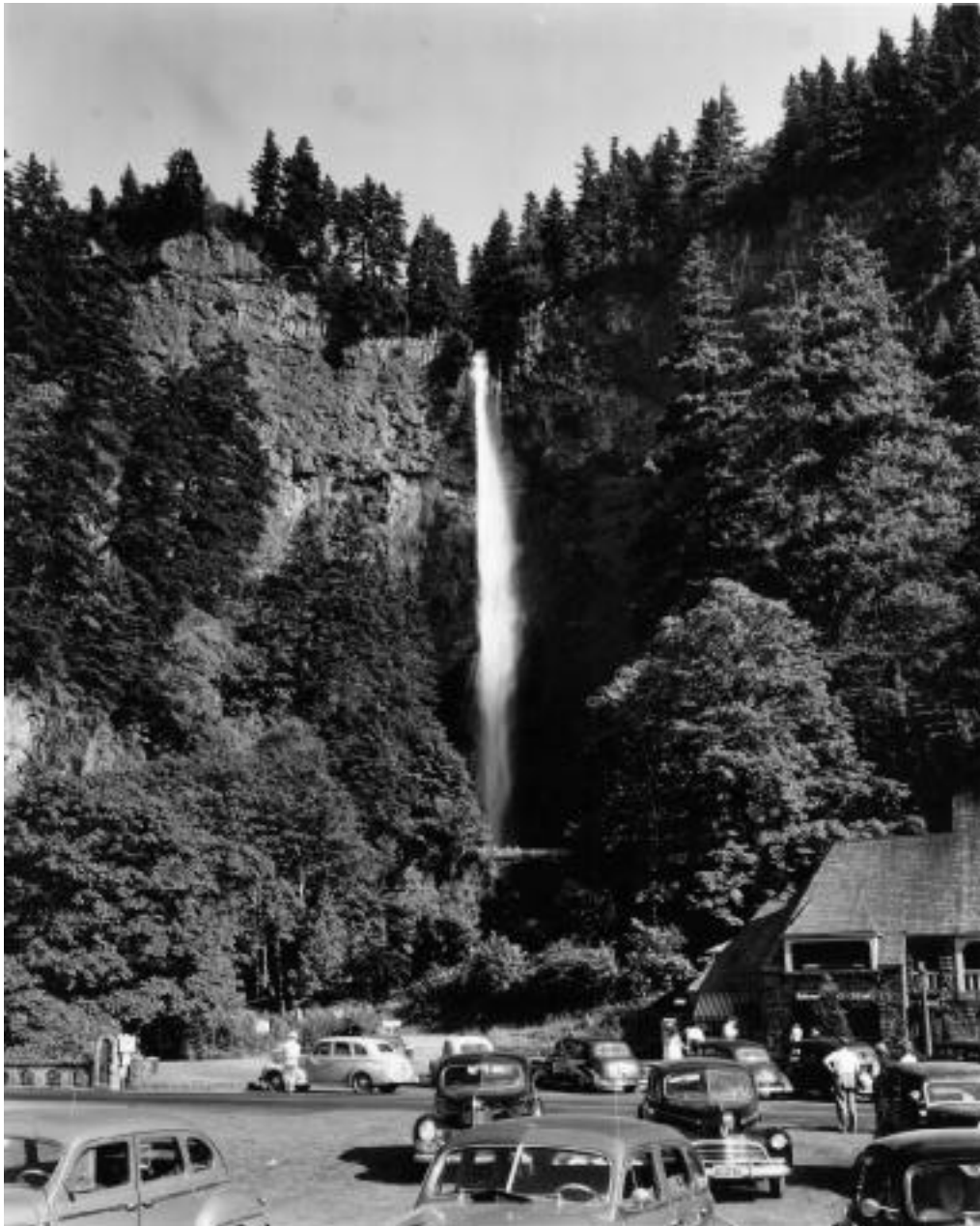
National Chiropractic Journal 1948 (Apr); 18(4): 36; journal caption reads: "Beautiful Multnomah Falls is an inspiring sight in the Columbia River Gorge." Caption on back of photo reads: "Multnomah Falls and Multnomah Lodge along Columbia River near Portland, in Oregon"