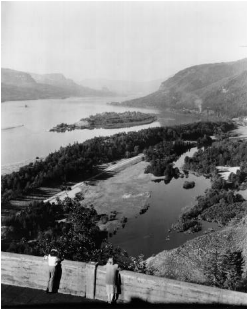
National Chiropractic Journal 1948 (Mar); 18(3): 9; journal caption reads: "A panoramic view of beautiful Columbia River Gorge which stretches for nearly 200 miles from Portland." Caption on back of photo reads: "Columbia River Gorge from Columbia River Highway at Crown Point, Oregon, East of Portland, Ore." Appears again in National Chiropractic Journal 1948 (Apr); 18(4): 37