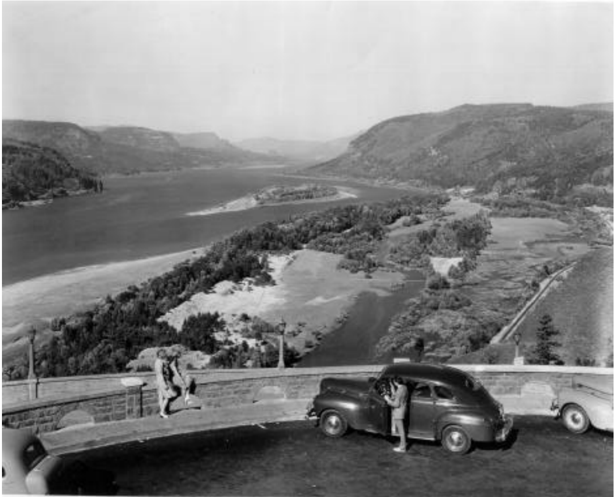
“The Gorge of the Columbia River from Crown Point on the Columbia River Highway”