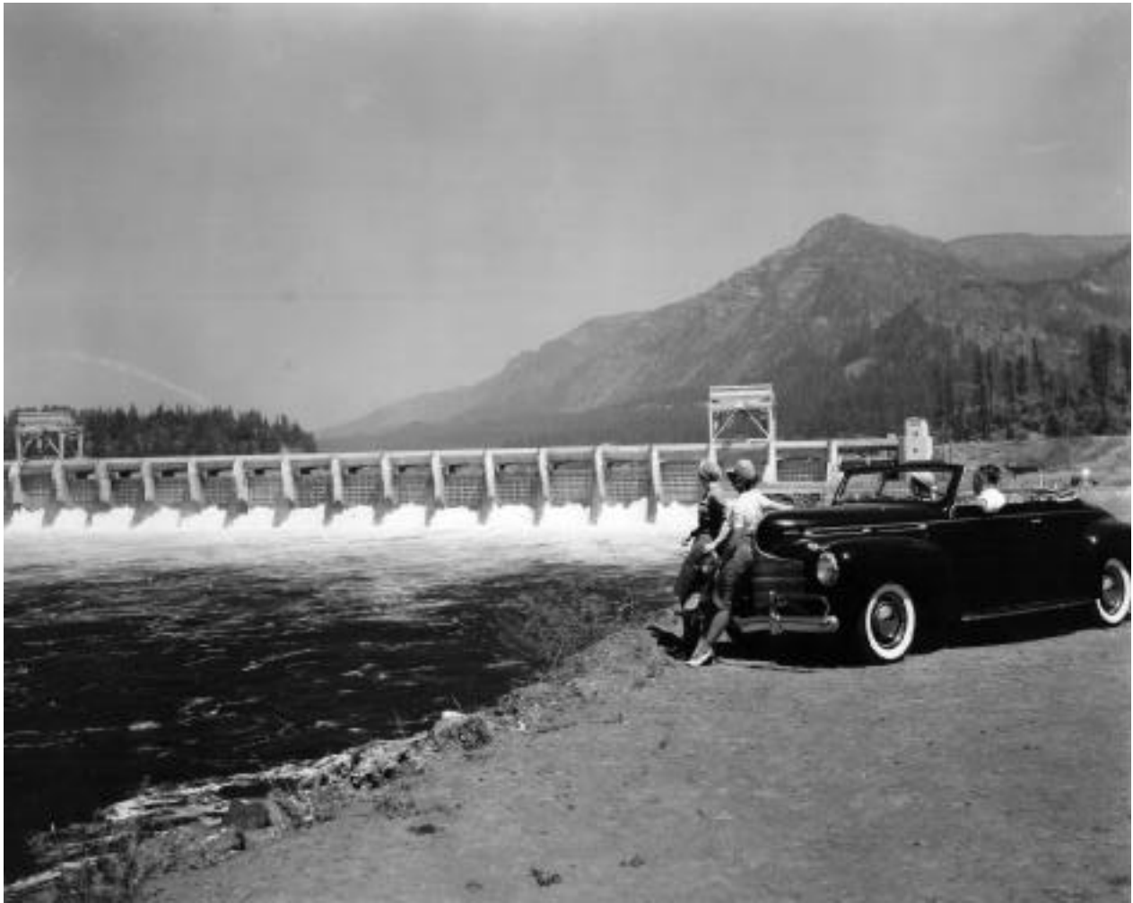
National Chiropractic Journal 1948 (Mar); 18(3): 10; journal caption reads: "The great Bonneville dam in the Columbia River built at cost of more than $100,000,000 is a sight well worth seeing. Caption on back of photo reads: "The spillway at Bonneville Dam on the Columbia River, 42 miles east of Poulson, Oregon"