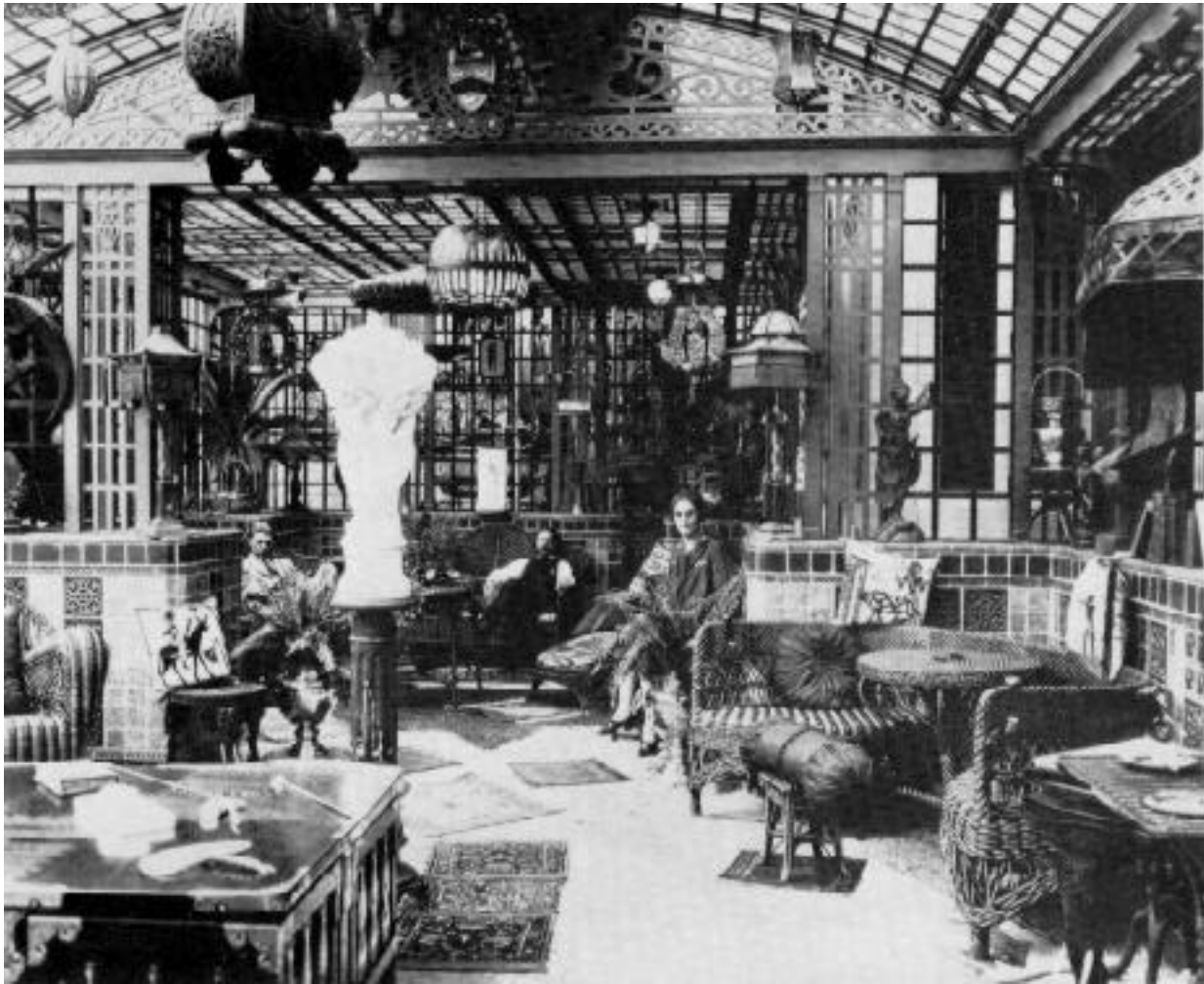
"Mother in the solarium of the mansion" (Palmer, 1977, p. 182)

Color Code: Red & Magenta: questionable or uncertain information Green: for emphasis