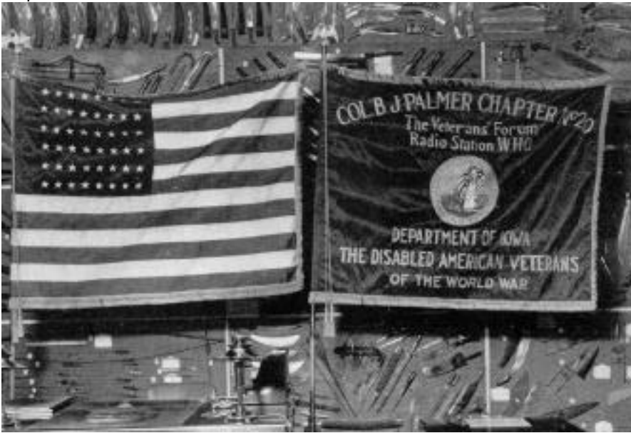
Figure ??-??: Part of Palmer's collection