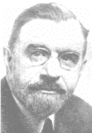
B.J. Palmer, circa 1949