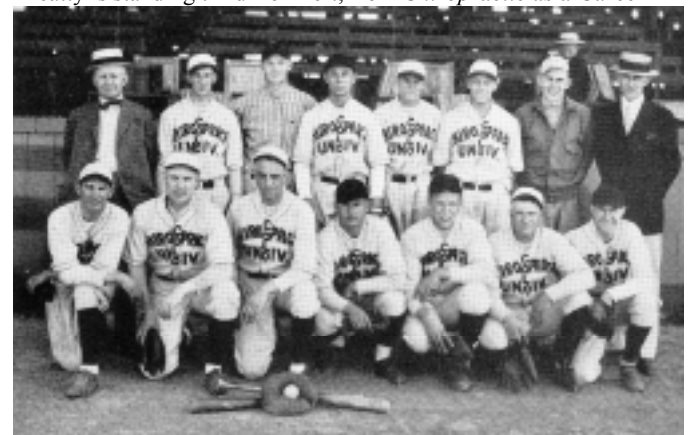
Colorado Chiropractic University Baseball Team, circa 1925; from Chiropractic as a Career