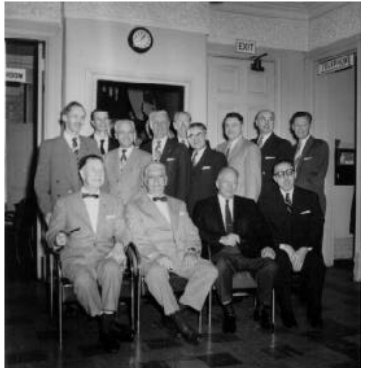
NCA Council on Education at its mid-year board meeting in Toronto during February 15-17, 1956. Seated, left to right, are: gentleman