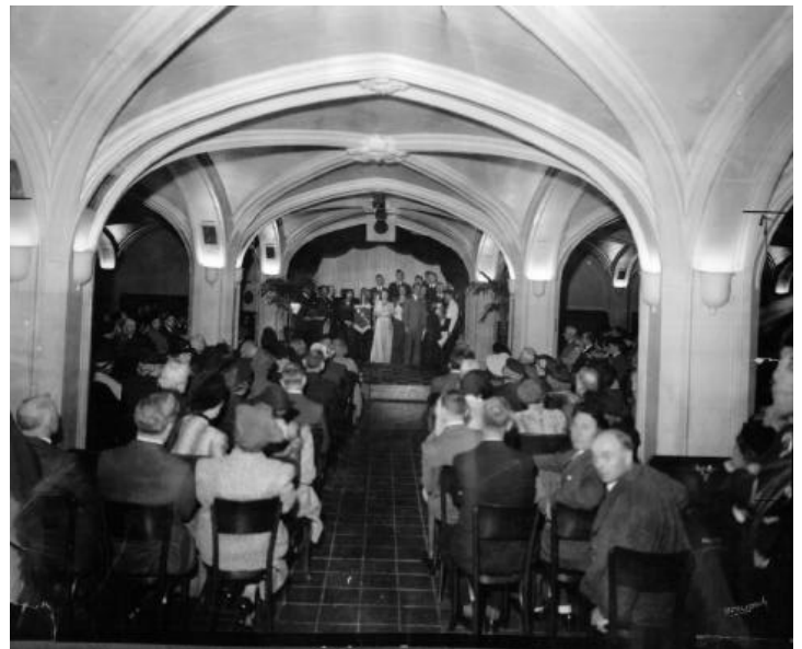
National Chiropractic Journal 1939 (Dec); 8(12): 7; journal caption reads: "'Miracles in Health' is broadcast every Sunday at 12:30 noon over station WELI - Dial 930 - with a studio audience of over 500 at Hotel Taft in New Haven. Photo taken during broadcast on October 15th shows part of the assembly." This photo accompanied article by F. Lorne Wheaton, D.C. [NCA Photo Collection]

1939 (May): National Chiropractic Journal [7(5)] includes: -"Many happy returns!" (p. 21):